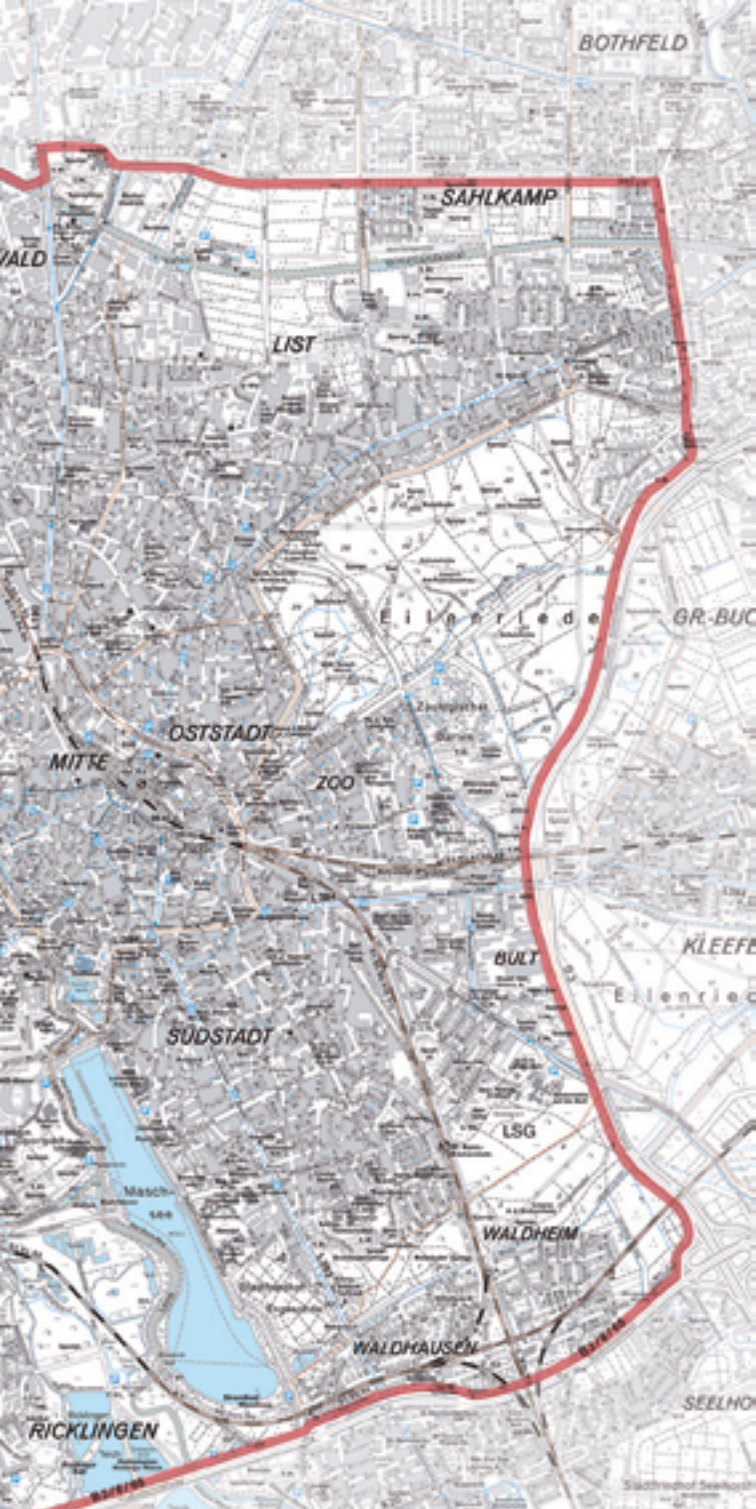
MAP OF HANNOVER LOW EMISSION ZONE, © LANDESHAUPTSTADT HANNOVER, GEOINFORMATION, 2009